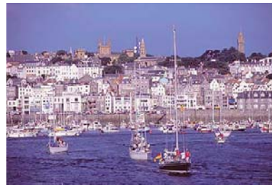
Guernsey is full of visitor attractions and places of historical interest