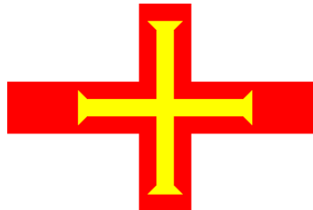
Flag is a mix of French Norman Cross and English George Cross