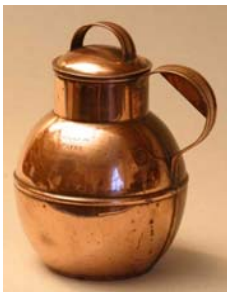
Traditional milk can