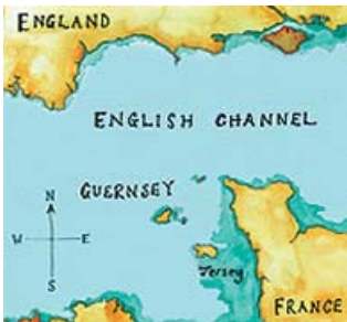
Location in English Channel