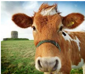
Guernsey cow and Martello tower in the background

Sponsored by Fortis Guernsey, Culture Guernsey and the Peninsula Hotel and held at the Peninsula Hotel