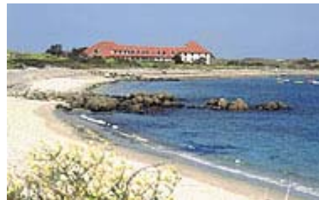
Venue Hotel on Guernsey's sandy west coast